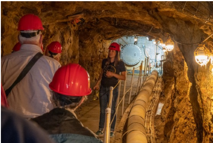
Inside the Argo tunnel