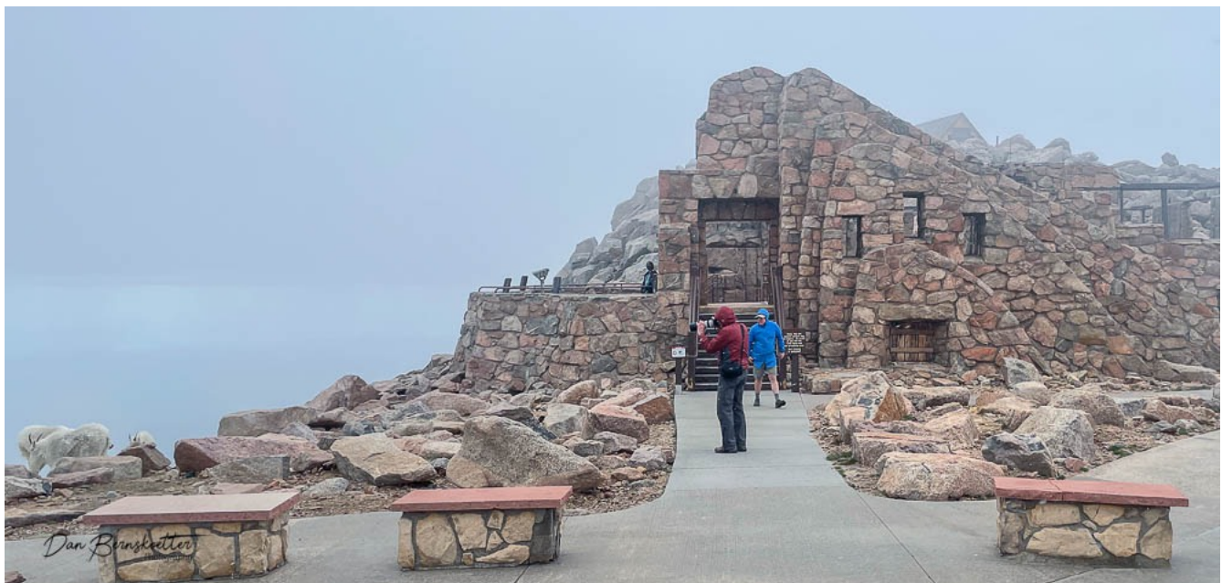
Crest House shrouded in mist.