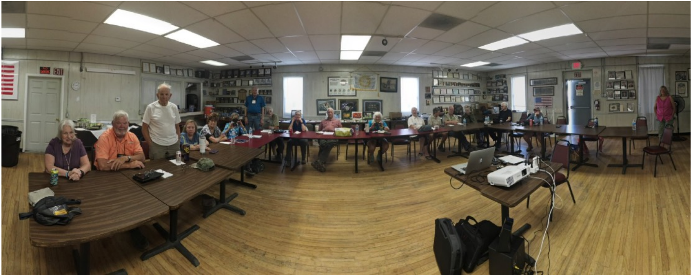
Panorama by drone