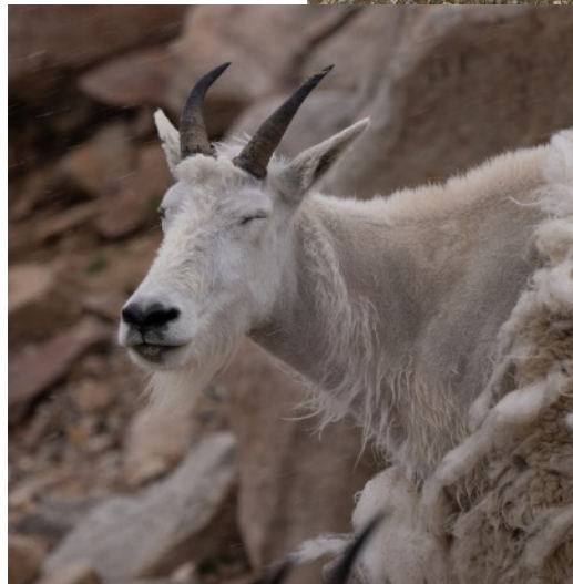
"Hey there, big boy..." she said with a wink.