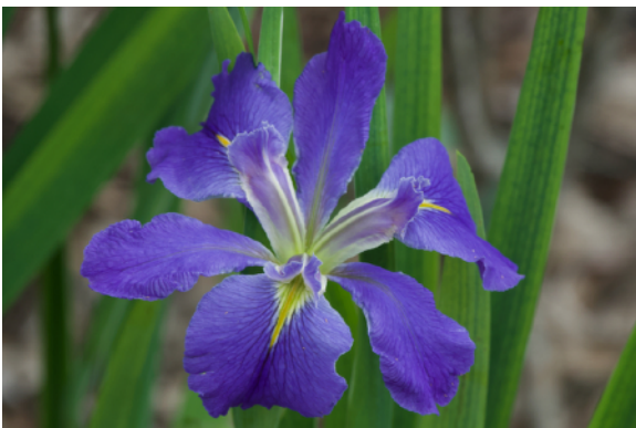
Imperial Iris © Virginia Staat HM, Flora category, RMOWP 2022 Contest

1st Judy Lehmkuhl - Inuit Boat with Raven