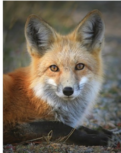
Red Fox 1st Place Member's Choice 2022