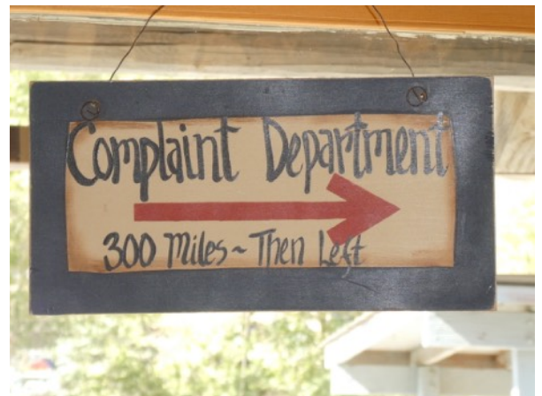
Sign at the Argo Mill... bet they didn't get a lot of complaints!