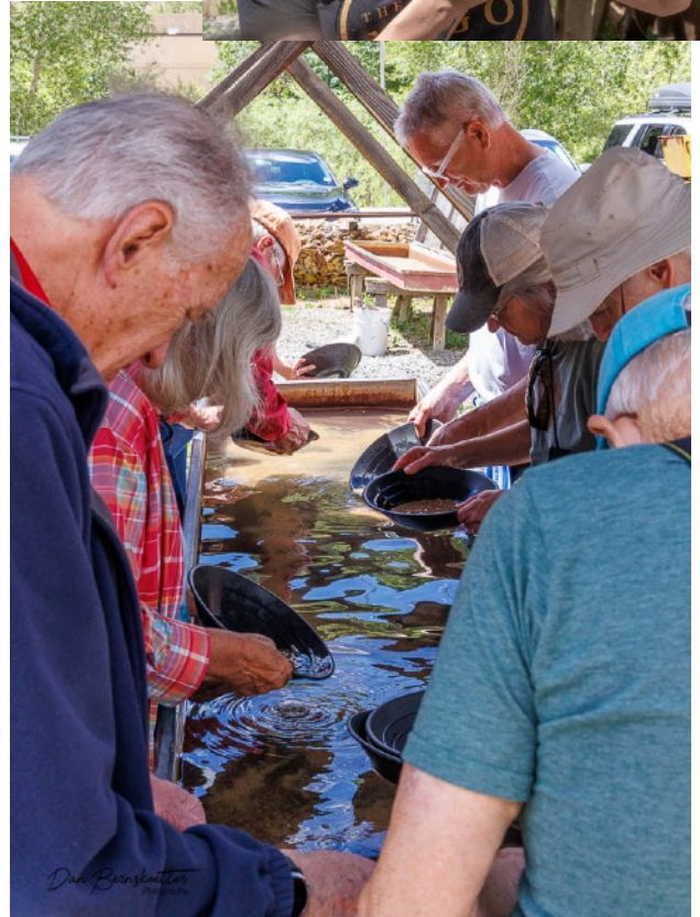
Panning for gold at the Argo.