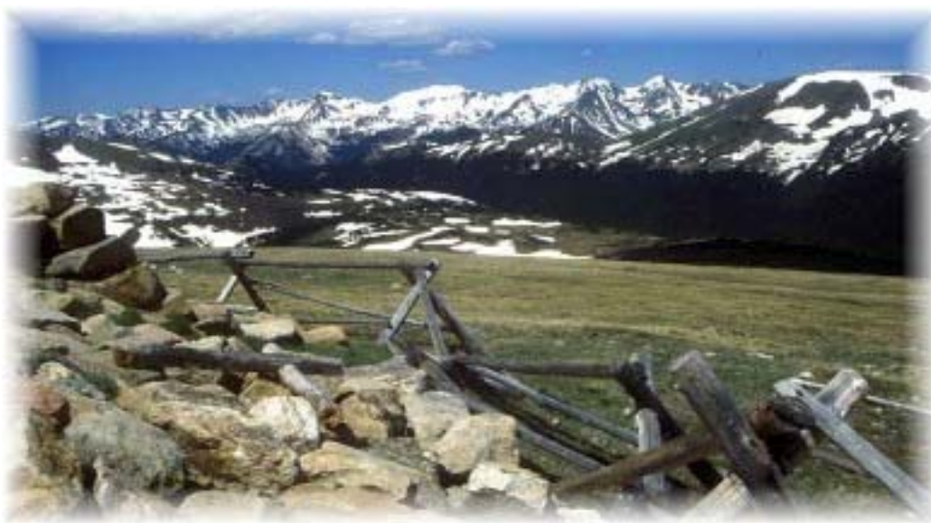
Rustic fence in Rocky Mountain National Park