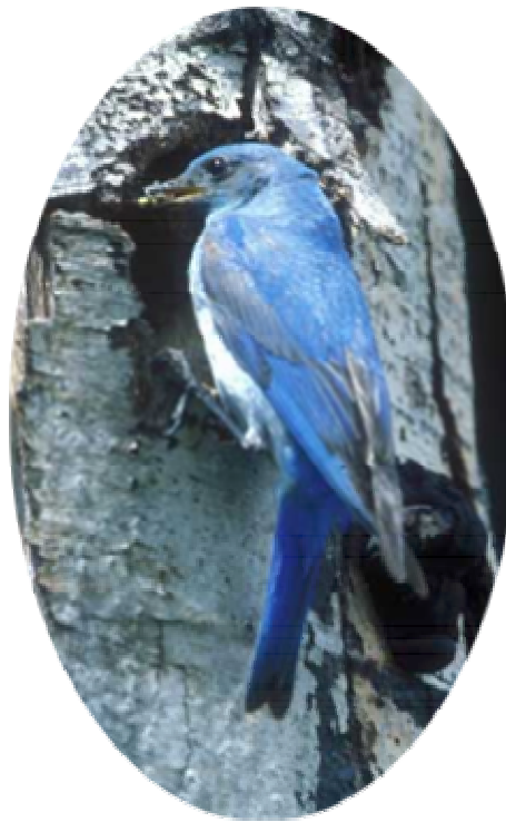
Bluebird