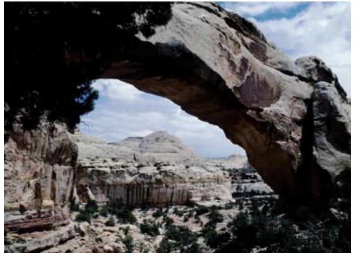
Hickman Bridge in Capitol Reef National Park

There are a couple of state parks near Zion which are open year-round and offer hiking and camping facilities. Coral Pink Sand Dunes State Park lies 12 miles off U.S. 89 between Mt. Carmel Junction and Kanab, less than 45 miles from Zion. The dunes are a vibrant color, less