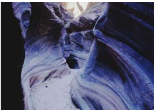
two views of Echo Canyon on the East Rim Trail Zion National Park