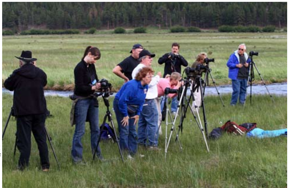
Photo shoot during 2008 workshop in Rocky Mountain NP