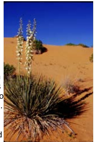
Yucca at Coral Pink Sand Dunes State Park

Snow Canyon State Park lies north of the city on Utah 18. Hiking and photography are easy and enjoyable in this park. Red Navajo sandstone is overlain by volcanic over-