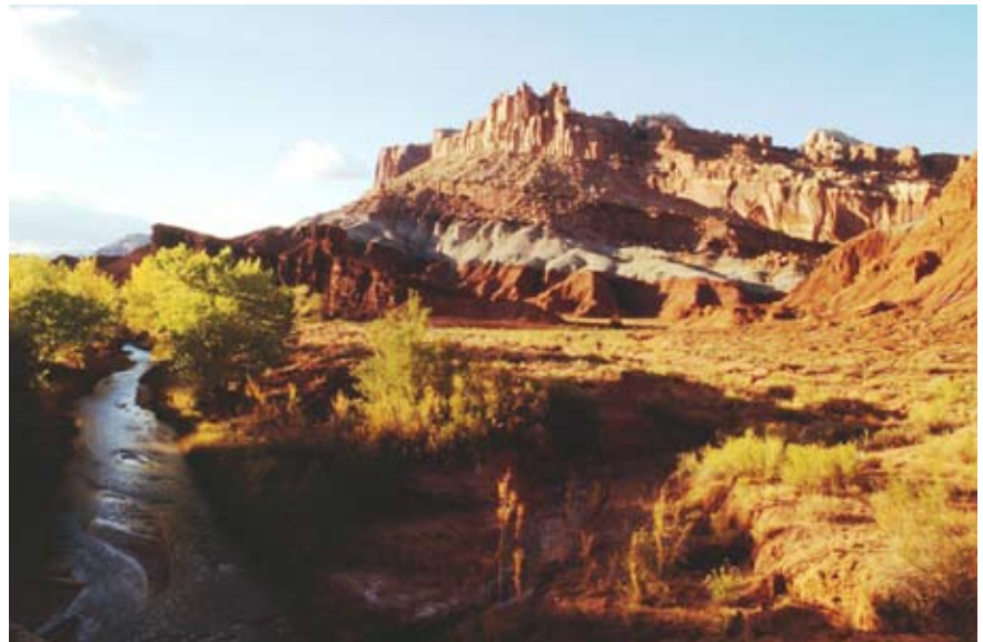
Fremont River and Waterpocket Fold in Capitol Reef National Park