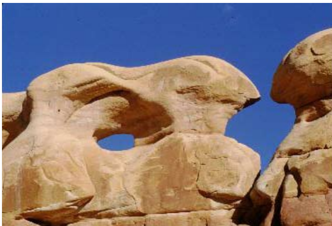
Devil's Garden in Grand Staircase-Escalante National Monument

This chilly fellow is wondering what happened to sunny New Mexico... this past week more closely resembled Fargo, North Dakota