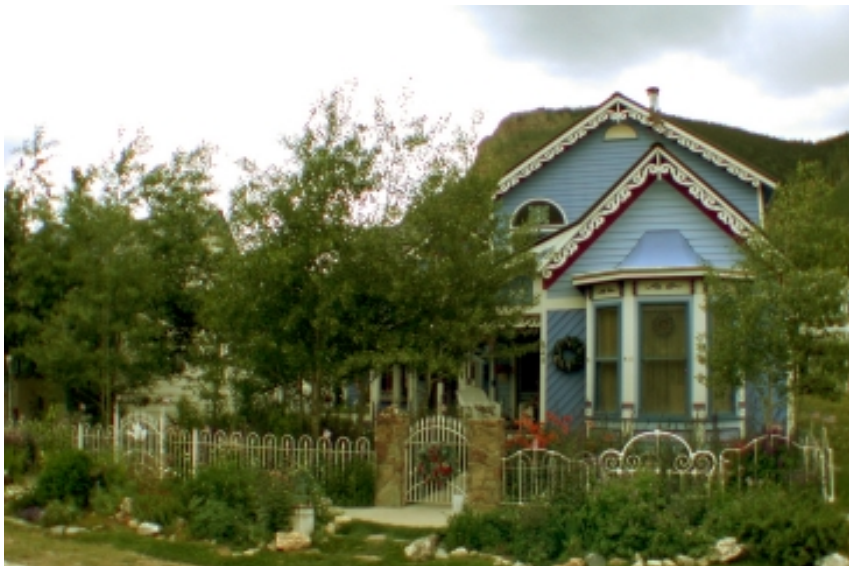
Historic home in Silverton, NV

Goodbye, Durango! We learned a lot while we were having fun.