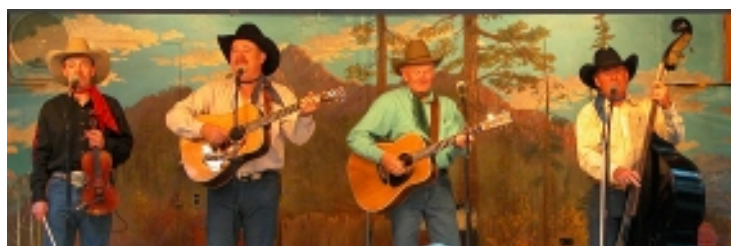
Bar -D-Wranglers entertain conference attendees.