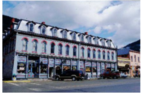
Silverton's main street