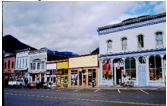
Silverton's main street

One of our field trips will be the Missionary Ridge Wildfire Restoration Project with the U.S. Forest Service. The Missionary Ridge fire started on June, 9, 2002 during a very dry summer after a dry winter. The area is northeast of Durango. Over 40 days, the fire covered 72,962 acres destroying 56 homes and 27 out-buildings. After the fire, satellite images were taken to understand the severity and range of the wildfire. The results showed that of the 72,962 acres involved, 22,542 acres burned at high severity, 21,822 at moderate severity, 13,872 at low severity, and 14,728 acres were essentially unburned. This field trip should provide an interesting insight into wildfires and how humans are dealing with the results.