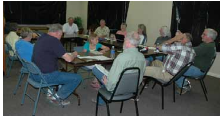
the board of directors hard at work