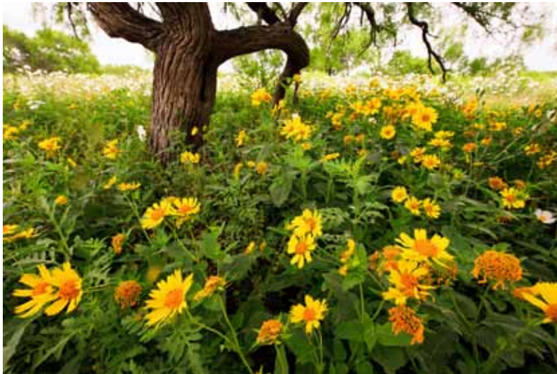
Flowers Under Tree 1st place, Flora