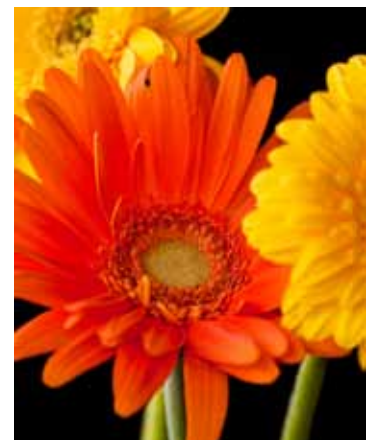
Happy Flower 3rd place, Novice