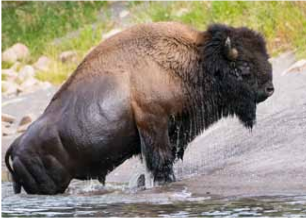
Lean 'n Mean 2nd place, Image from Last Conference