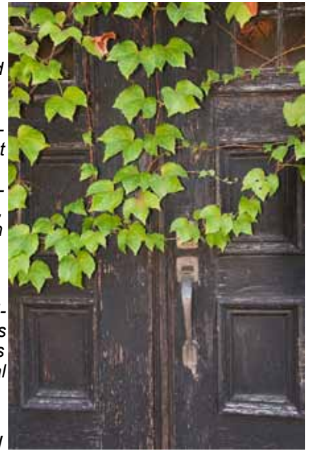
Undisturbed Entryway Honorable Mention, Historical

This small hardbound volume is lavishly illustrated with photos from the county located in the far northeast corner of Georgia. Photos include mountain vistas, waterfalls, outdoor recreation on the Chattooga River and autumn color. Local barns are also shown as well as wild-life from bears to birds to butterflies. There is also a section on local wildflowers.