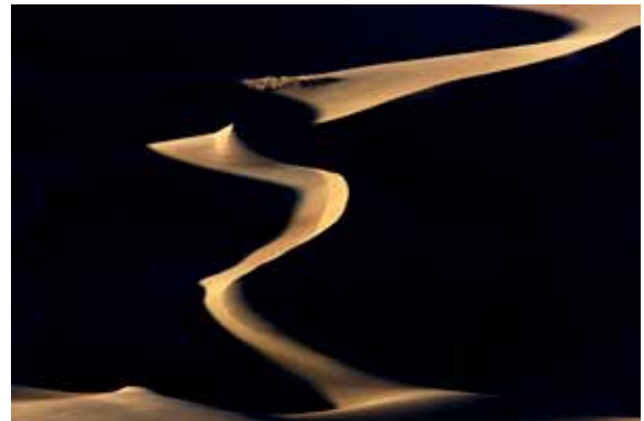
Sand Line 1st place, Scenics