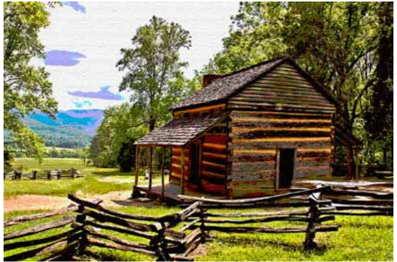
Colorful Cabin © Terry Guthrie Honorable Mention, Altered/Composite