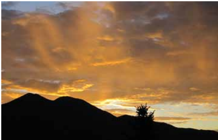
Sunrise over Taos Mountain

Conference headquarters will be the Sagebrush Inn/Comfort Suites complex (see www.taoshotels.com ), and more information, including registration details and a tentative schedule, will appear in the next newsletter and be posted at www.rmowp.org when available.