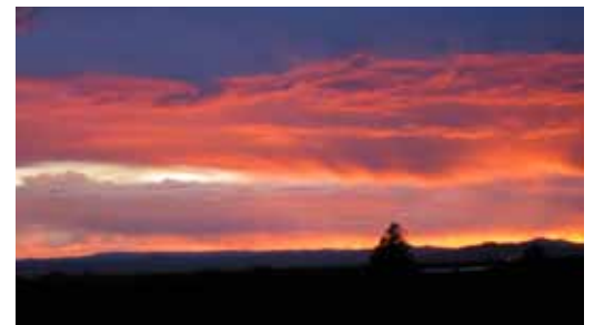
Taos Sunset

A pre-conference six-hour nature writing workshop with author Mary Taylor Young is scheduled Sunday, or early attendees can instead choose an all-day whitewater raft trip on the Rio Grande that day. The actual conference begins late Sunday afternoon with our usual opening reception following by a showing of all photo contest submissions.